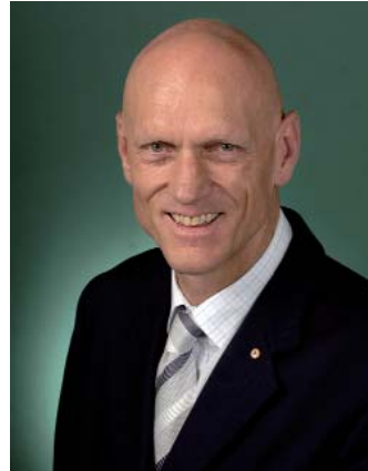
The Hon Peter Garrett AM MP, Minister for School Education, Early Childhood and Youth